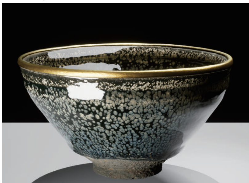
3DCG model of National Treasure Tea Bowl (Yuteki Tenmoku)