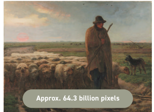
The Return of the Flock (Yamanashi Prefectural Museum of Art) 53.5cm × 71.0cm