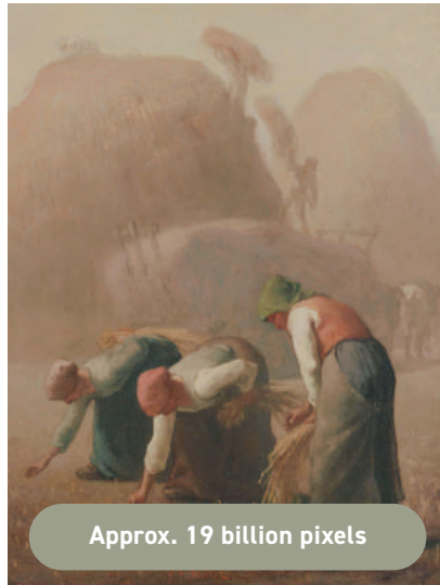
Summer, The Gleaners (Yamanashi Prefectural Museum of Art) 38.3cm × 29.3cm